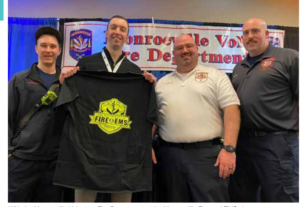
With the Monroeville Volunteer Fire Department at the Monroeville Fire and EMS show.