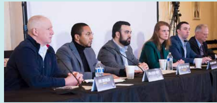
I also took part in the committee's hearing in Rankin focused on addressing blight and the need for affordable housing.