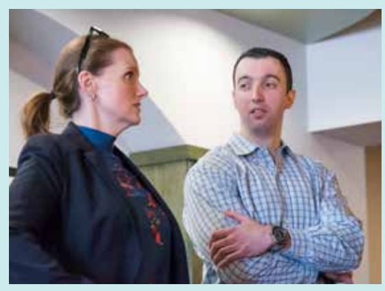
As an advocate for workers and businesses, I participated in the PA House Democratic Policy Committee's discussion with UFCW Local 1776 and Coffee Tree Roasters' workers and owners to discuss how unions are good for business.